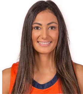
24 AUTUMN CEPPI FR. - F - 6-1